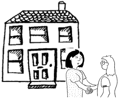
Supported living (Help with your lifestyle)