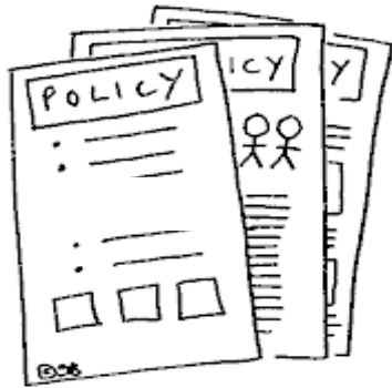
How policies are made