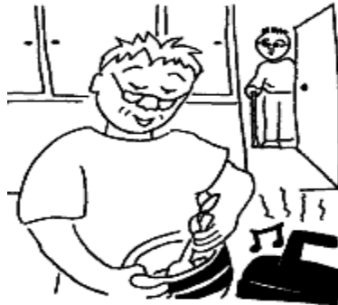
Whole life planning