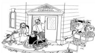
We're opening a bank account for Zoe's support money.

Step 4 – Managing your Individual Budget – you take as much control as you want over the money and the possible service