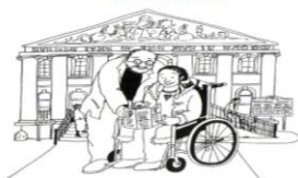
So it looks like I can get £15,000.

Step 1 - Assessment – you are told how much you can expect to receive based on a simple assessment