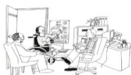
Yes - it looks like a good plan.

Step 3 - you get the plan agreed with the local authority – who appoints you an agent if you need one