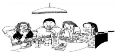
My life's changed – I'm in control.

Step 6 - Live Life, you can use your money flexibly in order to achieve real outcomes that make a positive difference