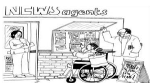
I can choose how I get my support.

Step 5 - you can use your money to buy support and to get help to organise your support