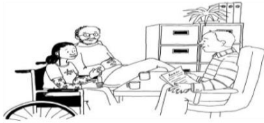
It's gone well. Let's talk about what's next.

Step 7 - you tell the local authority how it's gone and what you are going to do next